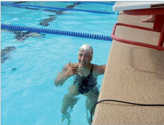
I'll take that time!