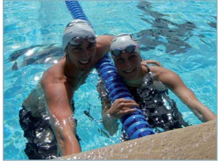
Friends even after a brutal fly race