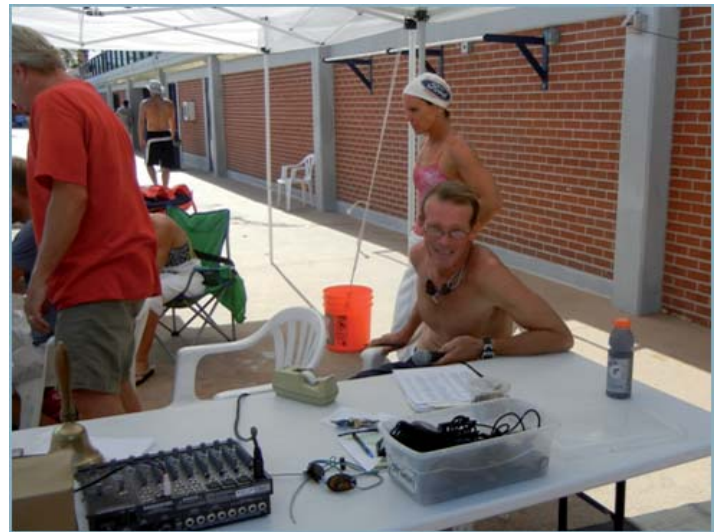
Everything is running smoothly