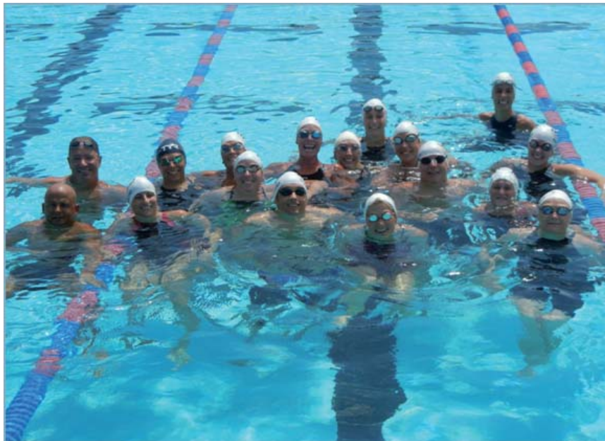
Making friends at workouts can help with motivation

measuring your progress. Tell someone else what your target is so you are accountable for reaching it. If you have a focused objective, it will prompt you to make each and every workout possible, and it will give you a purpose for being there. To give yourself a measurable account of how you're doing, set small goals every six weeks. Reward yourself when you hit your goals. Refocus, and stay ambitious if you miss.