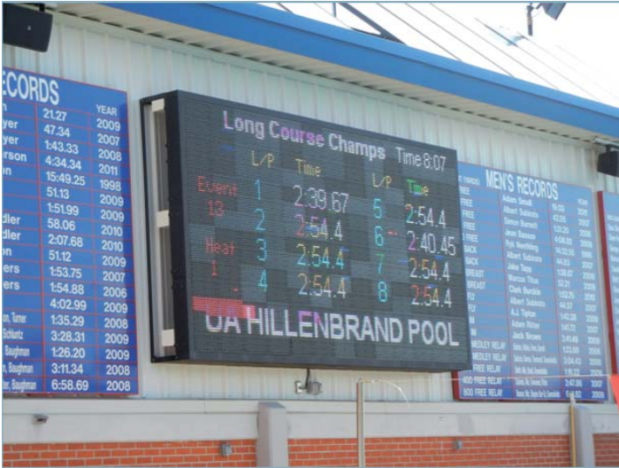
A great day for a meet