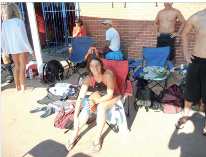
Remember the sun screen