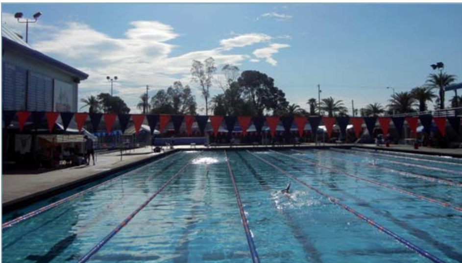
Discover what inspires you